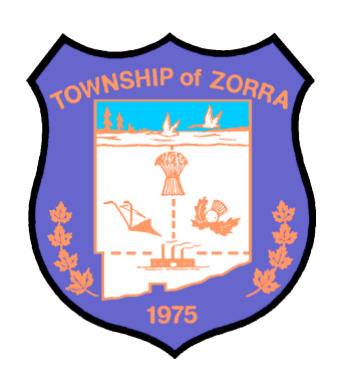
BY-LAW NO. 50-12

BEING A BY-LAW TO GOVERN AND REGULATE THE MAINTENANCE, OCCUPANCY, USE OF, AND OTHER MATTERS PERTAINING TO, THOSE PORTIONS OF PUBLIC HIGHWAYS UNDER THE JURISDICTION OF THE TOWNSHIP OF ZORRA KNOWN AS BOULEVARDS.